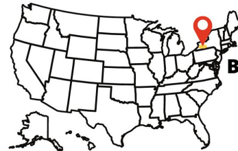
Buffalo, New York

It is heartbreaking. This shooting in New York happened on May 14, 2022. Within the 10 days between that and the Texas school shooting, there were 18 mass shooting events around this country. As of the airing of this episode, there have been 69 since then and counting. (Wikipedia: "List of Mass Shootings in the United States in 2022.") People in this country are vehemently arguing over how this got so out of control - gun control issues, mental illness funding, violent video games, and easy access to gruesome news and social