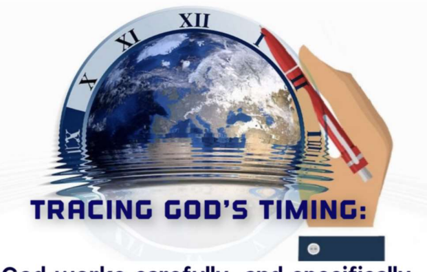
God works carefully, and specifically uses time as a precision tool.

Times: Strongs #2540 kairos; of uncertain affinity; an occasion, i.e. set or proper time