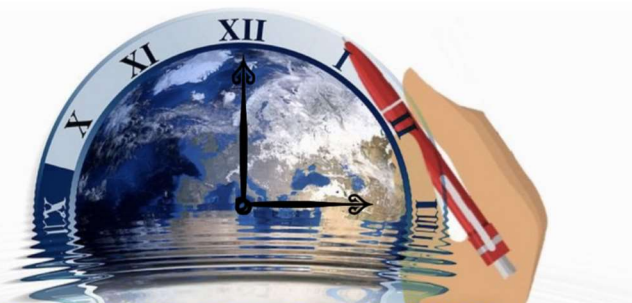
TRACING GOD'S TIMING:

Essentially, the time to plant prophetically given to Abraham was the time to uproot. In AD 70, there was the scattering of Israel throughout the world, and they remained scattered for a long time.