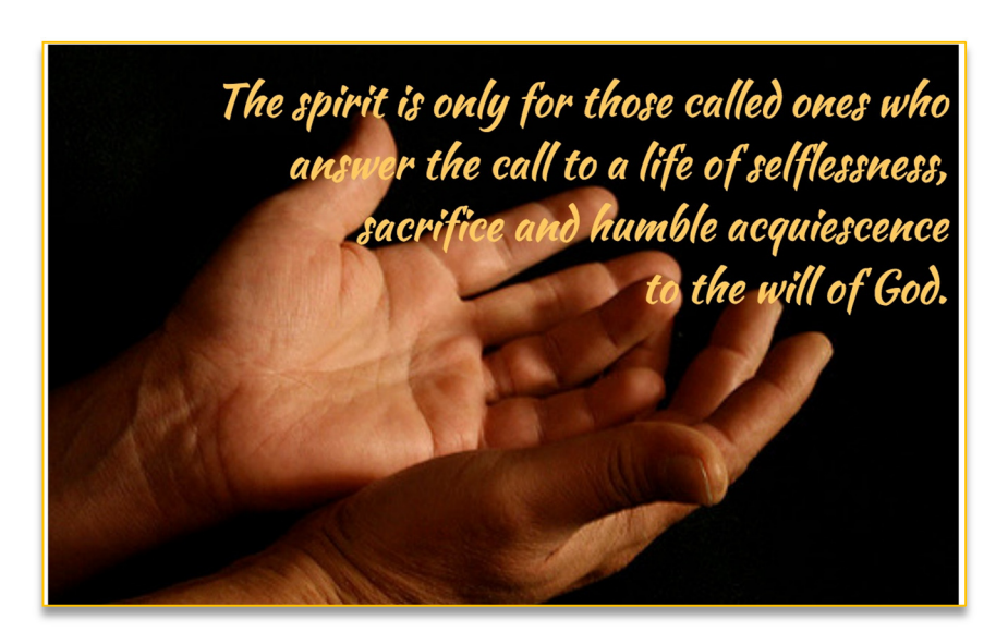
What else should we be looking out for?

It is a terrifying thing to fall into the hands of the living God - God's power and influence should not be taken lightly. This is life-altering power with consequences. The Spirit is for followers of Jesus, but not just casual followers.