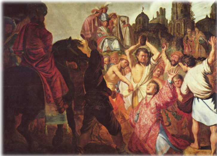
"The Stoning of St. Stephen," by Rembrandt Harmensz. van Rijn 1606 – 1669 oil on panel, located at Musee des beaux-arts, Lyon France