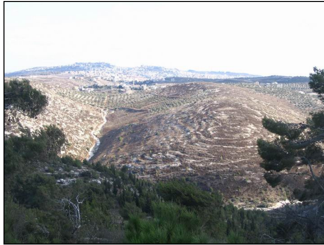
A view towards the south, where the ancient road of Via Maris passes through the hills. In the background - the Arab City of Um-El-Fakhem - which sits above the road.