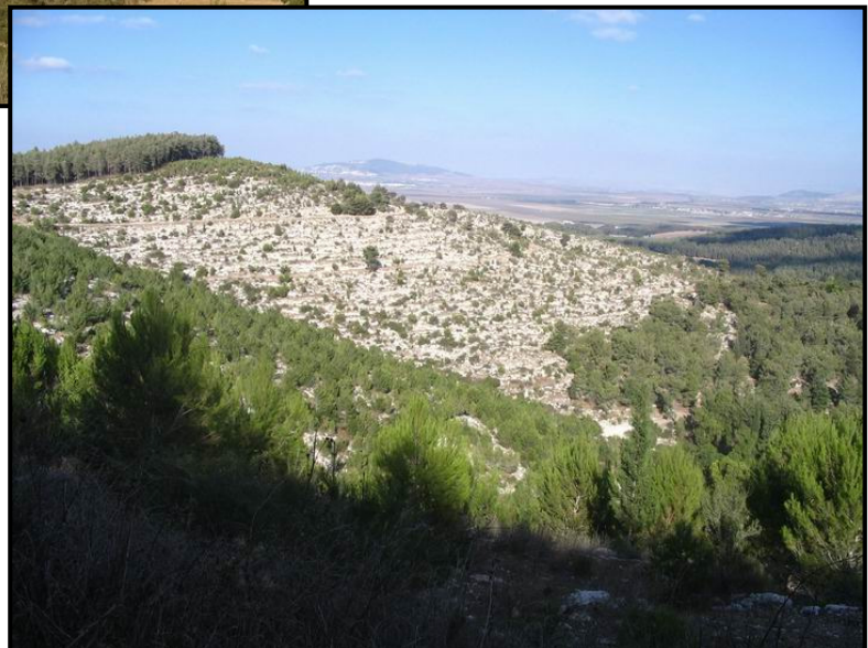
The south hills above Megiddo