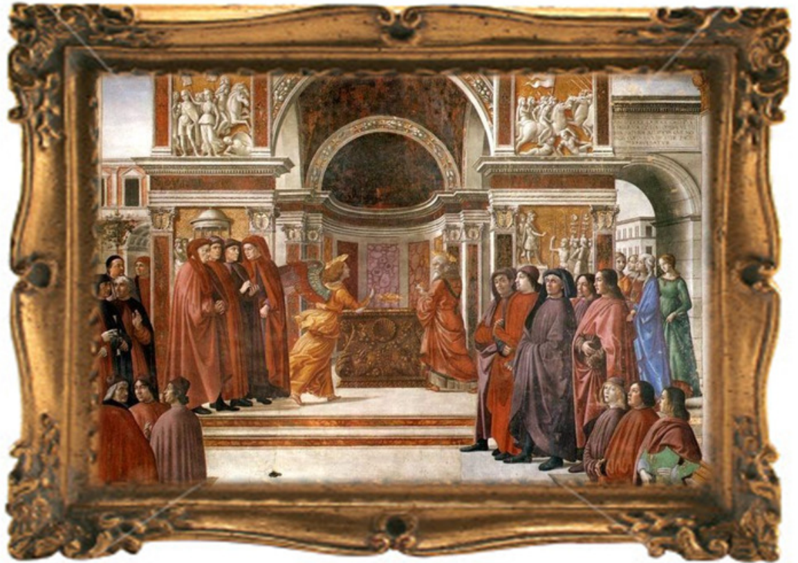
"Angel Appearing to Zacharias," by Italian Renaissance painter Domenico Ghirlandaio (One of his apprentices was Michelangelo) Fresco Cappella Tornabuoni, Santa Maria Novella, Florence

The angel had a special message to the parents of John the Baptist - this would be a special child to be raised carefully.