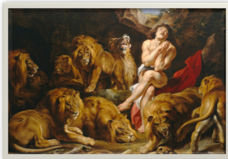
"Daniel in the Lion's Den," by Peter Paul Rubens oil on canvas— c. 1615 National Gallery at Art, Washington DC

Many paintings depict Daniel in this scene as a strong, young man - but he would have been over 80 years old!