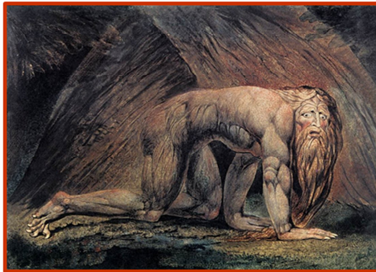
"Nebuchadnezzar," by William Blake copper plate – c. 1795 Tate Britain, London