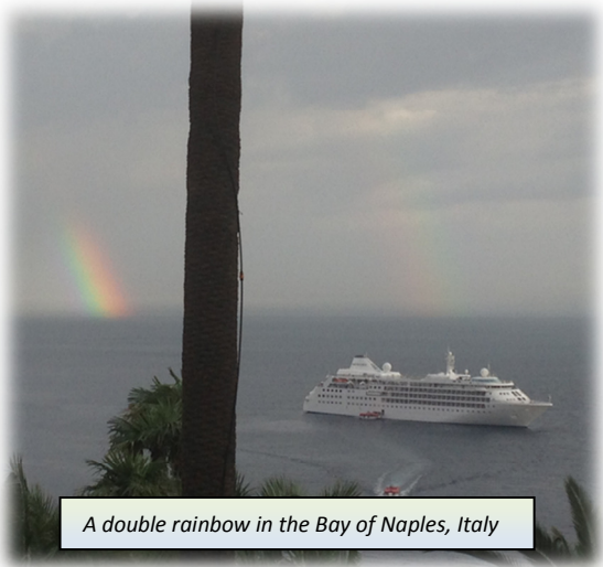
A double rainbow in the Bay of Naples, Italy

Isaiah 55:8-11: (NRSV) 8 For my thoughts are not your thoughts, nor are your ways my ways, says the LORD. 9 For as the heavens are higher than the earth, so are my ways higher than your ways and my thoughts than your thoughts. 10 For as the rain and the snow come down from heaven, and do not return there until they have watered the earth, making it bring forth and sprout, giving seed to the sower and bread to the eater, 11 so shall my word be that goes out from my mouth; it shall not return to me empty, but it shall accomplish that which I purpose, and succeed in the thing for which I sent it.