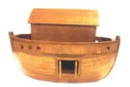
Noah's righteousness saved humanity through the flood