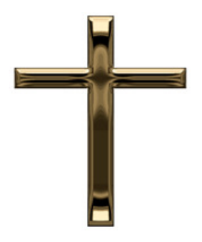
Jesus' righteousness will save humanity through Armageddon.