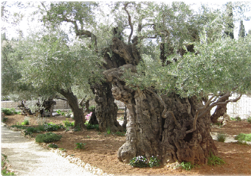
Olive Trees in the Garden of Gethsemane, Jerusalem

44 In his anguish he prayed more earnestly, and his sweat became like great drops of blood falling down on the ground. 43 Again he came and found them sleeping, for their eyes were heavy. 44 So leaving them again, he went away and prayed for the third time, saying the same words. 45 Then he came to the disciples and said to them, Are you still sleeping and taking your rest? See, the hour is at hand, and the Son of Man is betrayed into the hands of sinners. 46 Get up, let us be going. See, my betrayer is at hand.