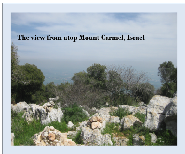
The view from atop Mount Carmel, Israel

There was chaos during this time and the people on the plane were totally alone. There must have been an enormous amount of fear.