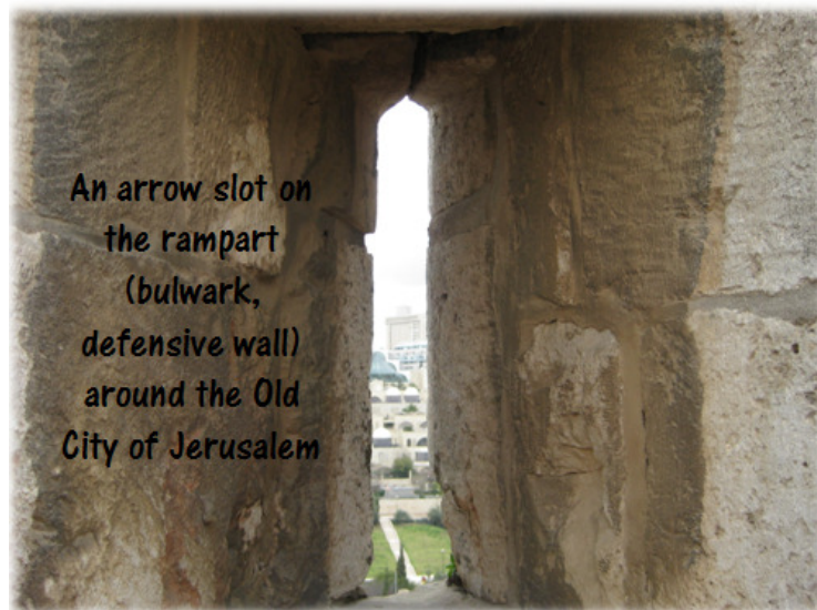
An arrow slot on the rampart (bulwark, defensive wall) around the Old City of Jerusalem

Habakkuk is now repositioned to stand, to watch and to receive, looking for his instruction. His prayer, while full of question, was full of faith and humility as well. He did all he could to clearly receive the answer, for he not only expected the answer, he expected to grasp it and to be able to use it to answer the unbelievers.