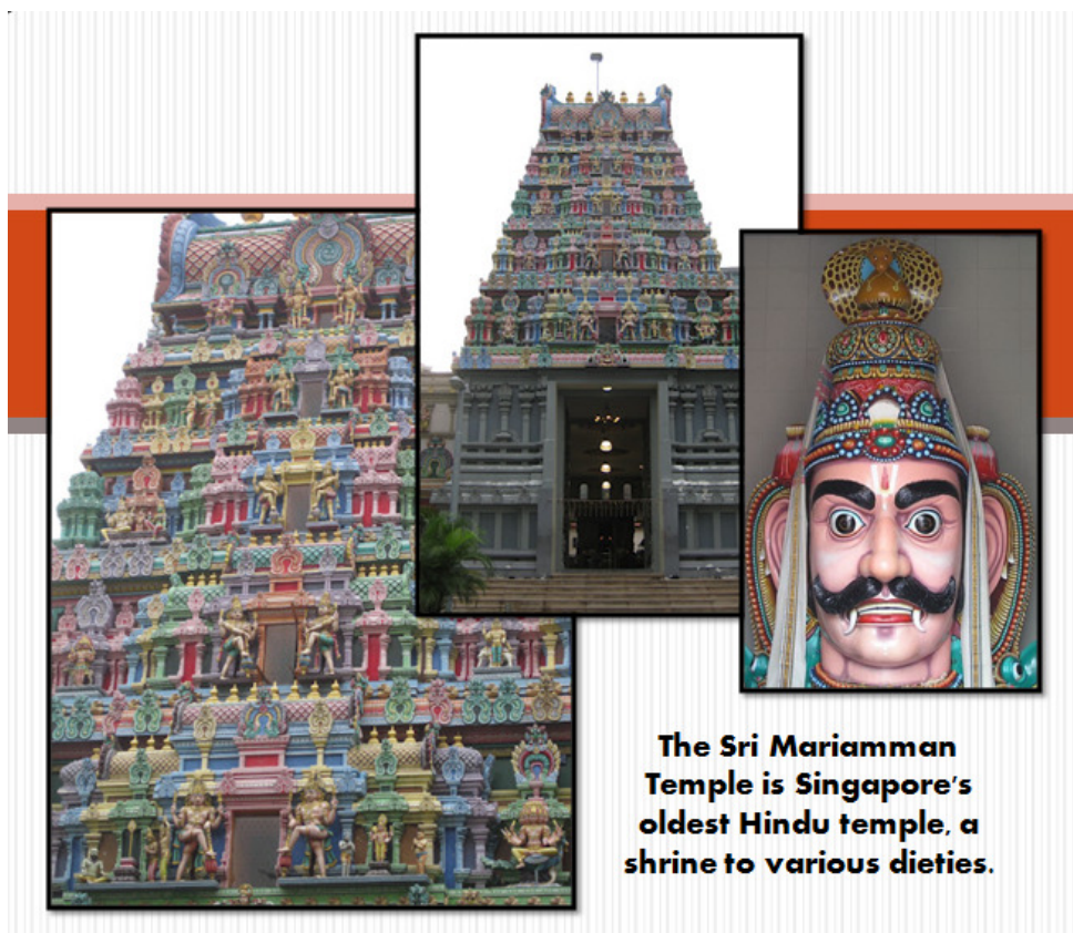
The Sri Mariamman Temple is Singapore's oldest Hindu temple, a shrine to various dieties.

An idol is anything that gets in the way of God being first...our 401(k), our car, our home, our spouse, our hobby...idols can be anything that take us away from God first. We need to keep things in the right perspective.