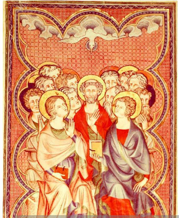
British library Pentecost Description: (Whole folio) The descent of the Holy Spirit, in the form of a large flattened dove flying down directly over the head of the Virgin and the twelve apostles. In the foreground, the Virgin and St. John are seated on a stone bench Title of Work: Psalter of Robert de Lisle Author: - Illustrator: Majesty Master Production: England [London?]; 1330-1340

Verses 32-33: " 32 This Jesus God has raised up, of which we are all witnesses. 33 Therefore being exalted to the right hand of God, and having received from the Father the promise of the Holy Spirit, He poured out this which you now see and hear."